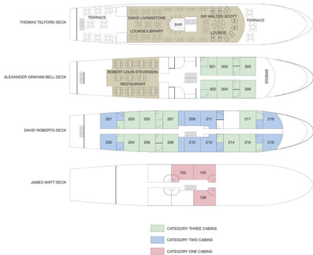
MV LORD OF THE GLENS DECK PLAN