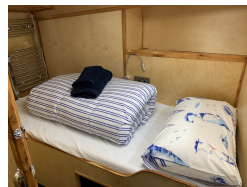
Twin / Double Cabin En-suite