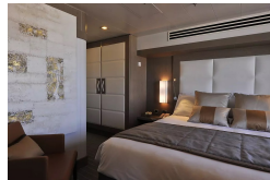
Prestige Stateroom - Deck 4