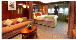
Magellan Deck Standard Suite