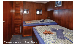
CABIN ABOARD SEA STAR