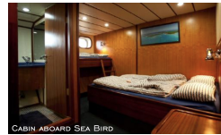
CABIN ABOARD SEA BIRD