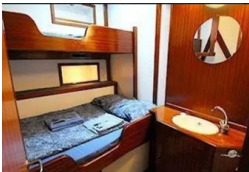
Category A Triple