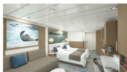
Aurora Stateroom Superior Single