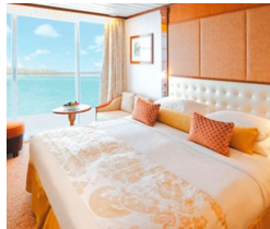
Balcony Stateroom. From