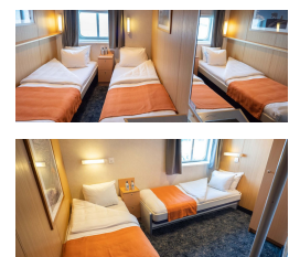
Twin Cabin Plus