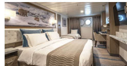
Aurora Stateroom Twin