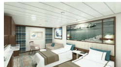
Balcony Stateroom - A