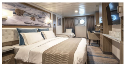
Aurora Stateroom Triple Share