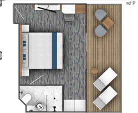
Category C Stateroom - Balcony Stateroom