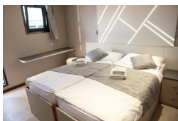
Main deck cabin