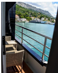
Upper deck balcony cabin