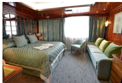
Shackleton Deck Owner's Balcony Suite ■