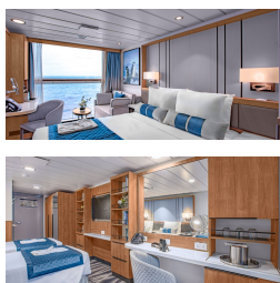
Category F Stateroom - Triple Stateroom