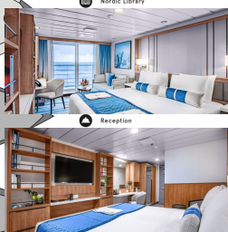
Category D Stateroom - Albatros State