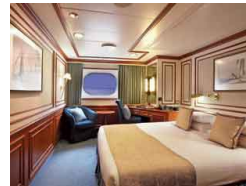
Category 1 Solo