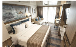
Balcony Stateroom - B