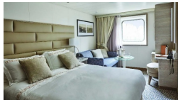
Cabin Category 4