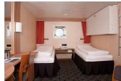
Cat 3 - Twin