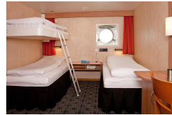
Cat 1A - Quad