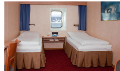
Cat 4 - Twin