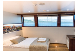
Main deck cabin for single occupancy