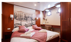
Above deck Cabins - From Lower Deck - From