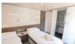
Lower Deck cabins - From