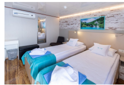
Lower Deck Single Cabin