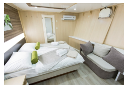
Main deck cabin