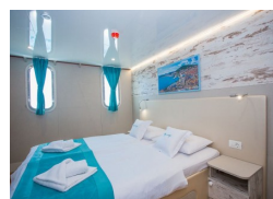
Main Deck Single