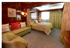
Byrd Deck Superior Suite