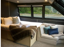
Resolution Deluxe Quadruple