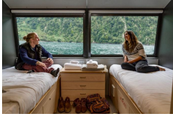
Governor Suite Executive King