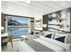
Aurora Stateroom Superior Single Aurora Stateroom Triple