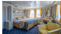
Superior Double/Twin Cabin