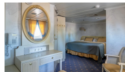
Owner's suites with private walkway