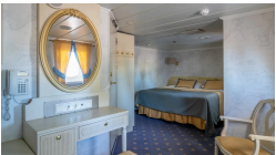
Owner's suites with private walkway