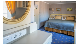
Executive Suites with Balcony