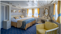
Standard Double/Twin Cabin