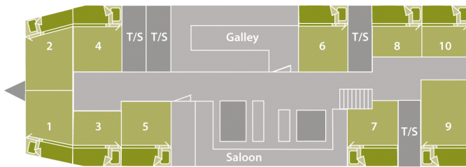
s/v Noorderlicht deckplan