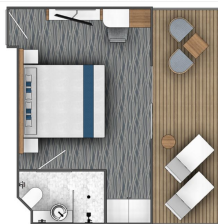
Category C Stateroom - Balcony Stateroom