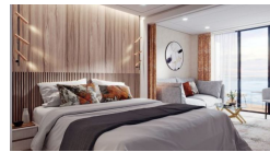
Balcony D6 - from