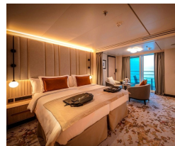
Oceanview D4 - from Premium Suite