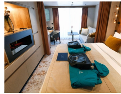
Balcony M5 - from