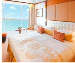
BALCONY STATEROOM S DECK 7