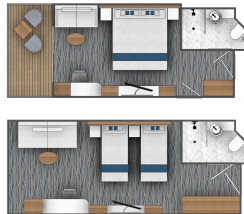
Category E Stateroom - French Balcony Stateroom