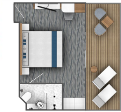
Category C Stateroom - Balcony Stateroom