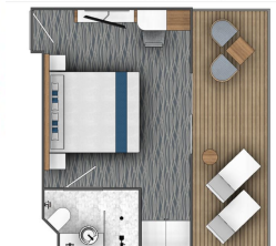
Category C Stateroom - Balcony Stateroom