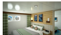
Category 1. From