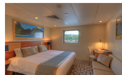
Promenade B Solo