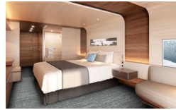
Grand Prestige Suite