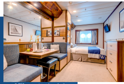
Category BX Deluxe DECK 1 Midship