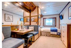
Category A DECK 2 Forward/Aft from