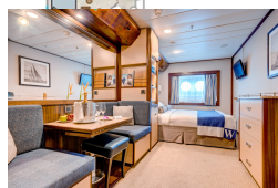
Category AX Deluxe DECK 2 Midship - From