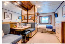
Category A DECK 2 Forward/Aft from