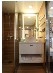
Prestige Stateroom Deck 5