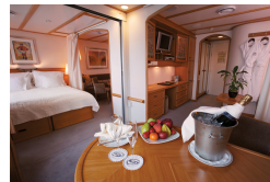
Commodore Suite Deck 2 Commodore Suite Deck 3