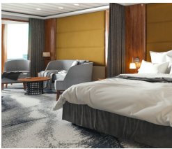
Polar Inside. From