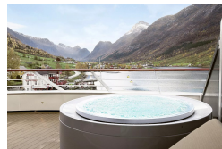
Prestige Deck 5 Suite