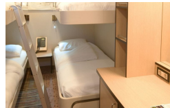
Polar Outside. From