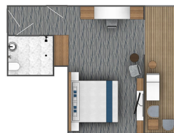
Category C Stateroom - Balcony Stateroom