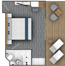
Category C Stateroom - Balcony Stateroom