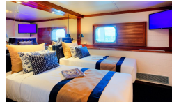
Orchid Cabins - Single