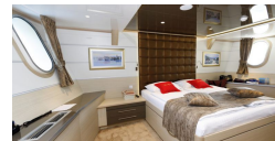
Category 6 Sole