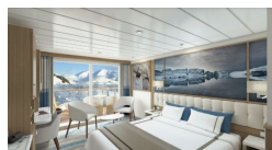
Balcony Stateroom Superior Junior Suite