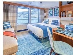
Category 5 Suite