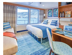
Category 5 Suite