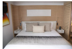
Deluxe Suite Deck 5