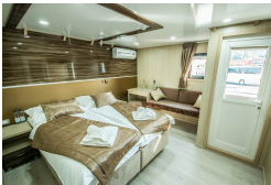
VIP Cabin (Upper Deck)